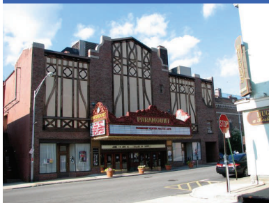
Paramount Center for the Arts